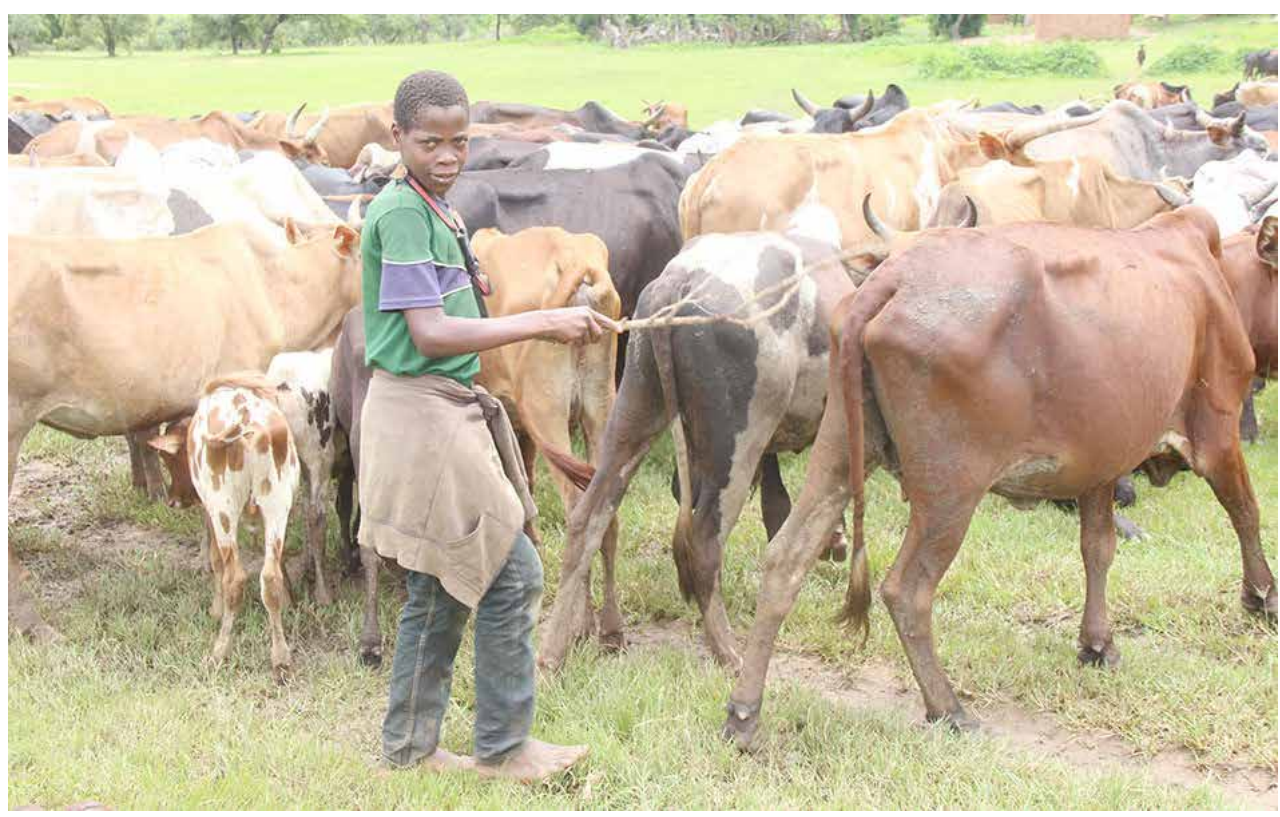
A grade five dropout boy of Chindwale village in Katete district heading after cattle

Kafue City Council to apply for billboards or bully anyone there. Yes, we have billboards in Kitwe, Ndola and Lusaka but we have never bullied any council CEOs whatsoever. We only have business relationships with these local councils, we always follow the laid down procedures and we have records and council approvals."