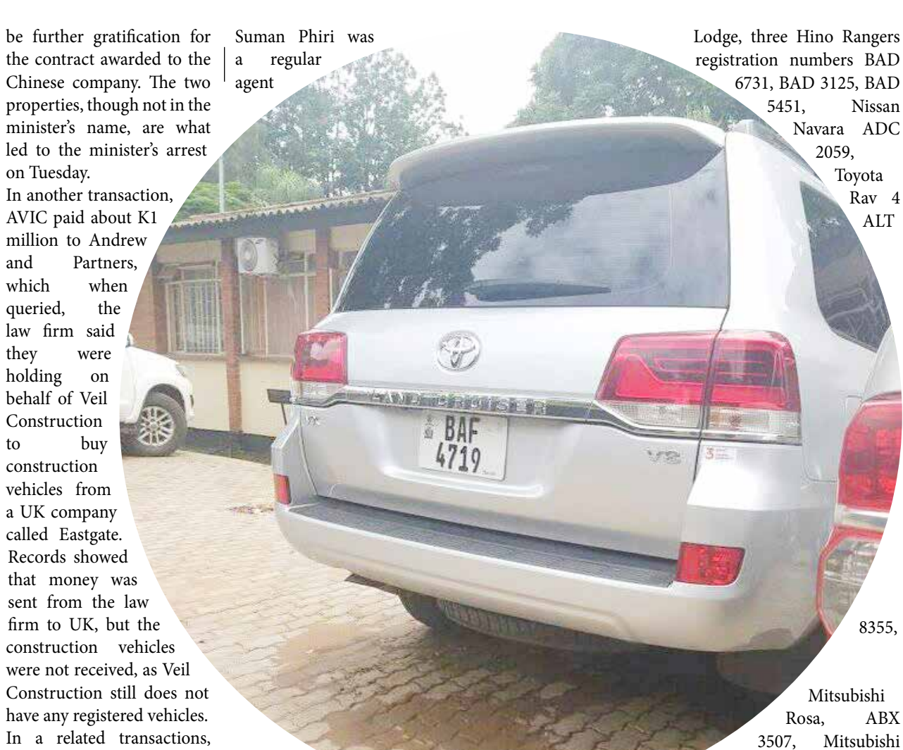
One of the vehicles which Chitotela allegedly forced RDA to buy for him.

After President Edgar Lungu succeeded Sata in 2015, he re-appointed Chitotela as deputy minister for sports and youth development before elevating him to a full Cabinet position of Works and Supply Minister. He was later moved to the newly created Ministry of Infrastructure Development, the where corruption scandals around him escalated before the ACC finally arrested him.