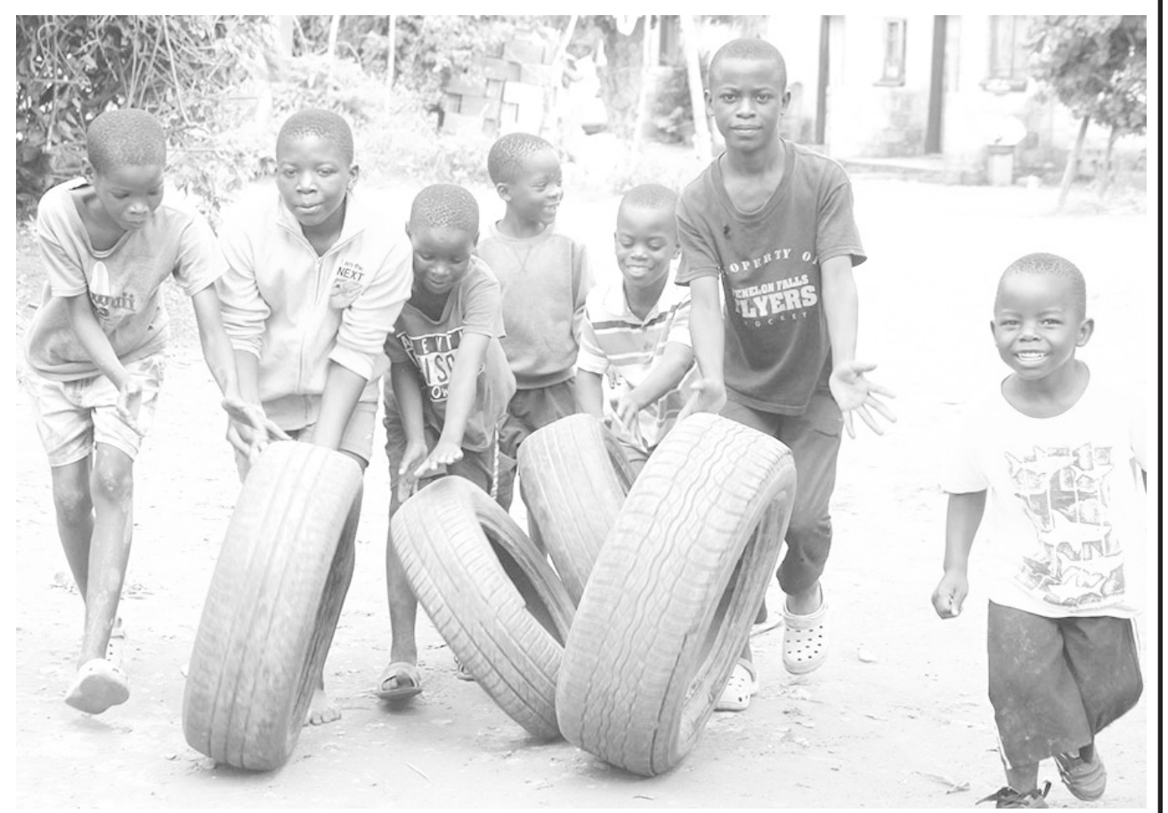
Children of Lusaka's Bauleni Compound play with used tyres

as illustrated through the PMI, revealed a sustained deterioration in business conditions during the first month of the New Year. "The headline figure derived from the Survey is the PMI. Readings above 50.0 signal an improvement in business conditions on the previous month, while readings below 50.0 show deterioration. At 48.1, the PMI continued to signal deteriorating economic conditions during January extending the current sequence of decline to six months. That said, the reading was up from 47.8 in December to indicate a slightly softer contraction," data revealed. And commenting on the Survey's findings, Stanbic Bank Zambia's head of global markets Victor Chileshe stated that consumer inflation may subside due to the relative stability of the kwacha against major currency convertibles. "Although higher fuel prices and currency weakness resulted in a sharp monthly increase in input costs, the rate of output price inflation moderated, which may be a sign that threats to a rise in consumer inflation are subsiding, especially since USD-ZMW remains stable," stated Chileshe. The Stanbic Bank Zambia PMI is based on data compiled from monthly replies to questionnaires sent to purchasing executives in approximately 400 private sector companies, which have been carefully selected to accurately represent the true structure of the Zambian economy, including agriculture and construction, among others.