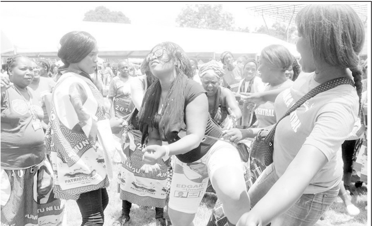
PF party women dance during this year's International Women's Day celebrations held at Lusaka Showgrounds on March 8, 2019