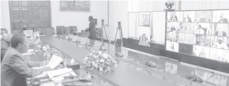
President Edgar Chagwa Lungu (left) speaks during the 1st Extraordinary Inter-Sessional Summit of Heads of State and Governments of the Organisation of African,Caribbean and Pacific States (OACPS) at State House in Lusaka on Wednesday, June 3, 2020.

“It is under President Lungu that the Financial Intelligence Centre Board that had won worldwide commendation for the professionalism; the Centre was dismantled with the chair momentarily replaced by a most unsavoury individual. The simple conclusion any observer will have is that President Lungu has a very disturbing relationship with corruption and the corrupt.”