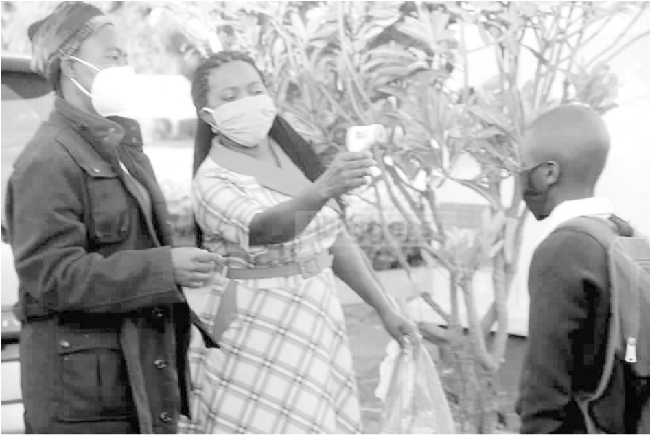
A Kabulonga Basic School teacher checks the temperature of grade nine and seven pupils

Aside from charging that President Lungu was using the COVID-19 pandemic as an excuse to ban parties from mobilizing, Kambwili, the former Roan PF member of parliament, also complained that the Head of State’s action showed that COVID-19 was a hoax in the country because President Lungu was not following government’s health guidelines, which included social distancing.