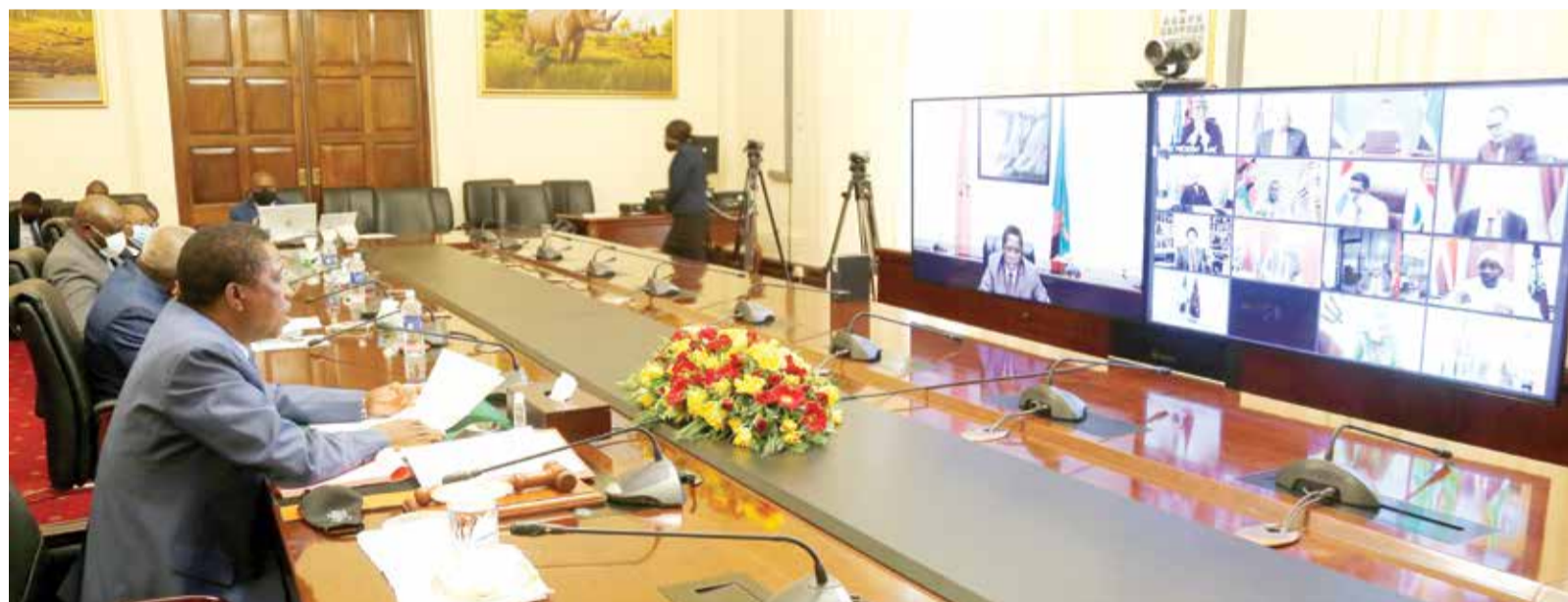
President Edgar Lungu (l) speaks during the 1st Extraordinary Inter-Sessional Summit of Heads of State and Governments of the Organisation of African, Caribbean and Pacific States (OACPS) at State House in Lusaka yesterday