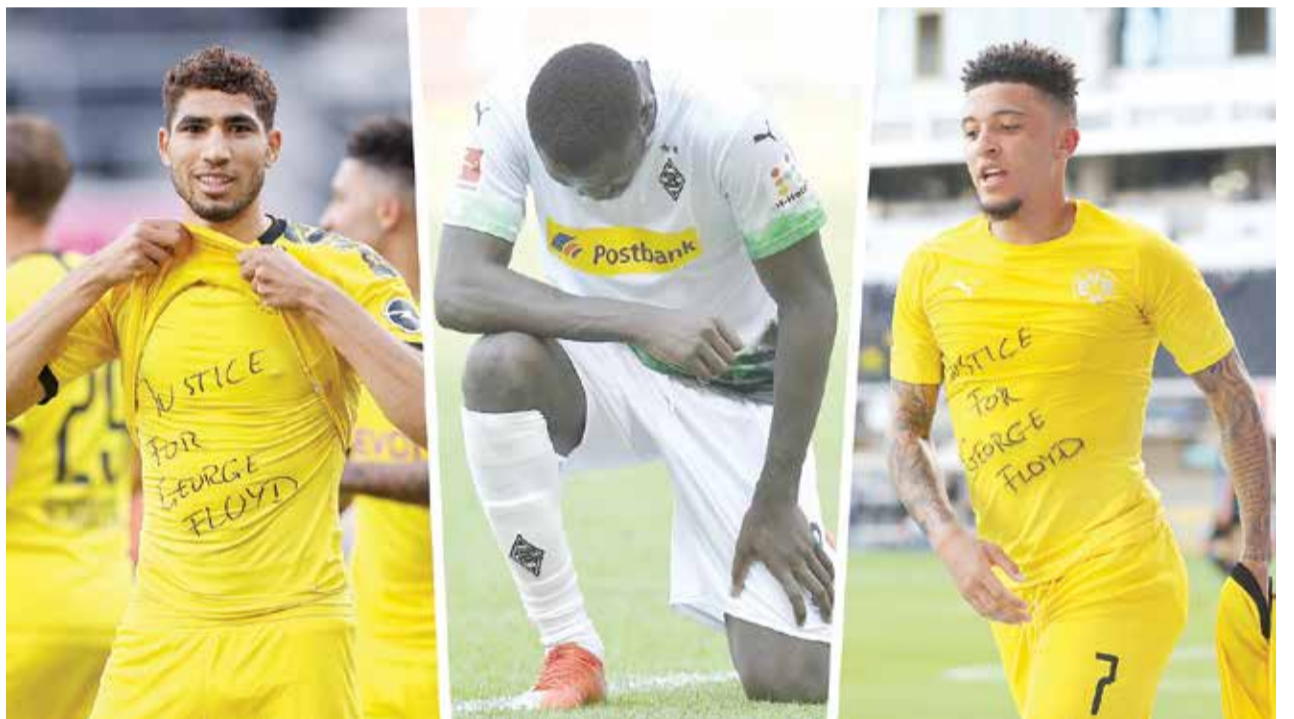
Achraf Hakimi, Marcus Thuram, Jadon Sancho show solidarity to the BLACKLIVESMATTER movement