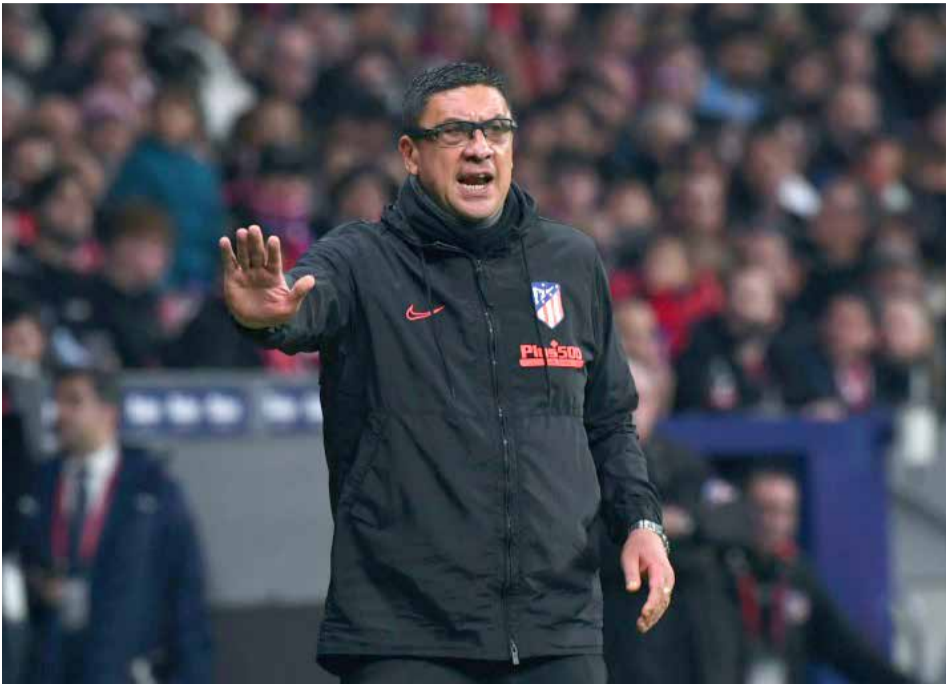
Atletico Madrid assistant coach German Burgos is leaving the club at the end of the season

DIEGO Simeone’s long-time assistant German Burgos confirmed on Wednesday he will leave Atletico Madrid at the end of the season to pursue a career as a head coach. Known for his tough approach and imposing demeanour, Burgos’ departure will be keenly felt by Simeone, whose own position at Atletico has come under scrutiny in recent years. After leading the team to a momentous La Liga triumph in 2014, Atleti