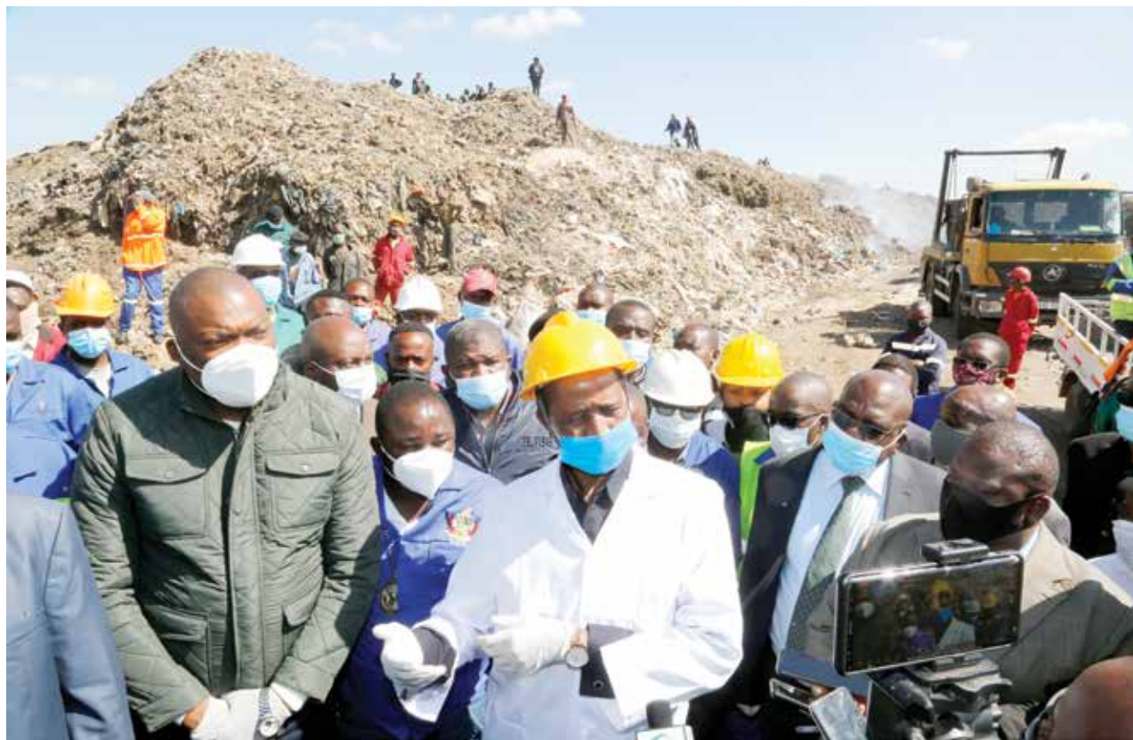
President Edgar Lungu (c) addresses the media after touring the Chunga Dump Site in Lusaka yesterday