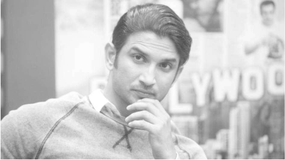
Sushant Singh Rajput's death was met with an outpouring of grief

THE death of Bollywood actor Sushant Singh Rajput on Sunday has sparked fresh discussions about mental health.