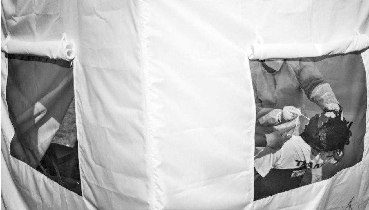
On Friday, a man is tested for coronavirus in Johannesburg, South Africa.

His funeral will be held later on Monday. BBC