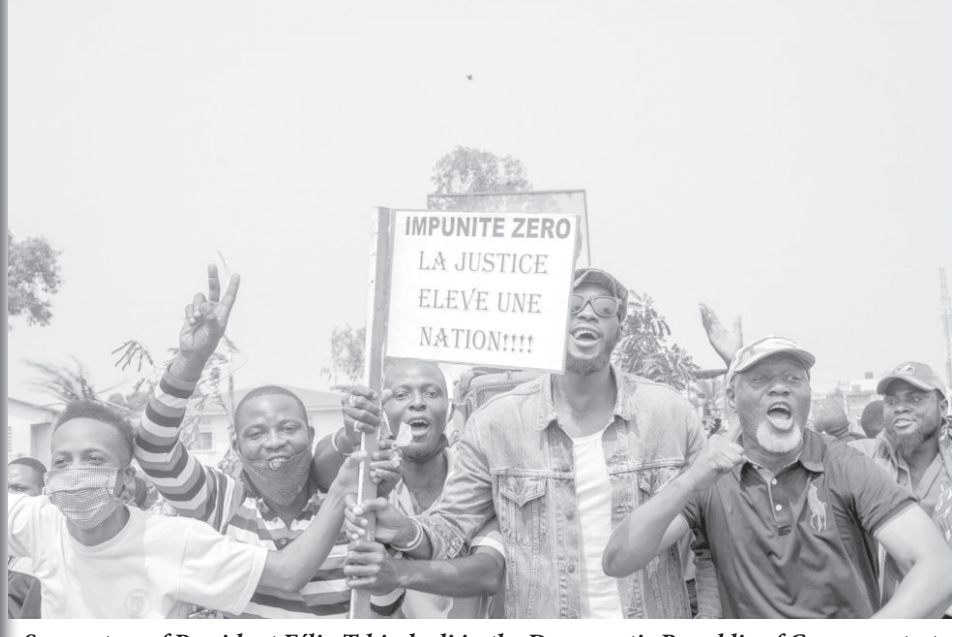
Supporters of President Félix Tshisekedi in the Democratic Republic of Congo protest against proposed changes to the judiciary on Wednesday.

This was after he disagreed with the ConCourt ruling that he has no jurisdiction to interpret the Constitution.