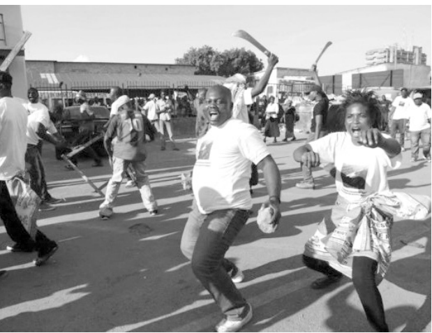
PF cadres protest after two of their cadres were beaten by UPND

“Let the law take its course and all those that will be found wanting should be brought to book. No one is above the law, we are all Zambians. This whole excitement is coming because of people wanting to think they have the right to do whatever they want to do, no. What has happened in Mufulira is uncalled for, it is an embarrassment to the people of this country and residents of Mufulira. For me two wrongs can never make a right, a wrong is a wrong. Whether it is PF or UPND who started the fight, it is not right! We are all Zambians for crying out loud. Even when there are killings, who are we killing? We are killing ourselves, we are killing