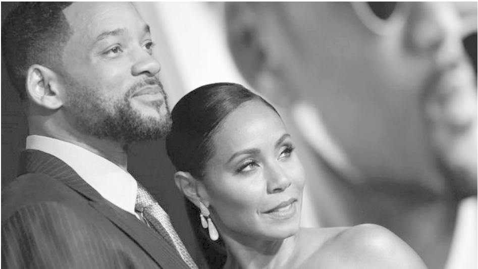
The couple have been married since 1997

JADA Pinkett Smith has revealed on her chat show in a heart-to-heart with husband Will Smith that she did have a relationship with singer August Alsina.