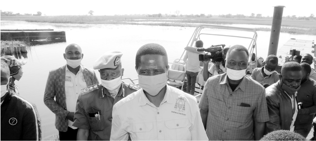
President Edgar Lungu (c) tours the Zambia-Angola Canal in Shangombo on Saturday, July 11, 2020.