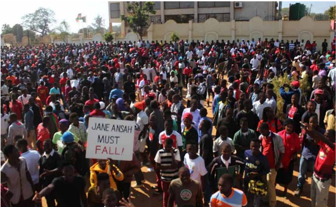
Protesters demand the resignation of Malawi's electoral commission chair Jane Ansah, who sought to help President Peter Mutharika cling to power