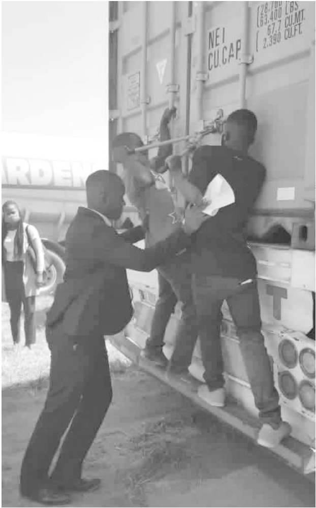
ZRA interceptes 4 trucks carrying assorted lotions worth over K1.7 million Chanida Border, yesterday.