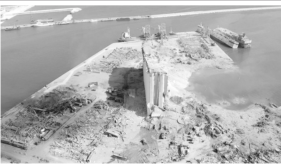
The explosion at a portside warehouse in Beirut sent devastating shockwaves across the Lebanese capital, decimating seafront buildings and causing widespread destruction.

More than 4,600 Malawians have tested positive for Covid-19, according to Johns Hopkins University, and at least 146 have died. BBC