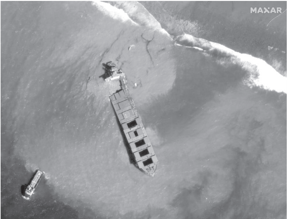
A satellite image shows tug boats and the broken-up MV Wakashio, that ran aground on a reef causing an oil spill, off the coast of Pointe d'Esny, Mauritius in this mid-August handout. The Japanese bulk carrier struck a coral reef on July 25, spilling about 1,000 tonnes of fuel oil in what environmentalists say is the country's worst ecological disaster, killing wildlife and damaging pristine waters. The bulk carrier, owned by Japan's Nagashiki Shipping and chartered by Mitsui OSK Lines, broke apart on Saturday, releasing a small amount of additional oil into the sea.

The US Secretary of State Mike Pompeo has tweeted his condemnation of the "mutiny":BBC