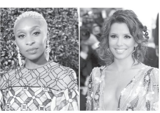
Cynthia Erivo and Eva Longoria are among the 819 new people invited to vote for the Oscars

areas where such groups need to be involved: