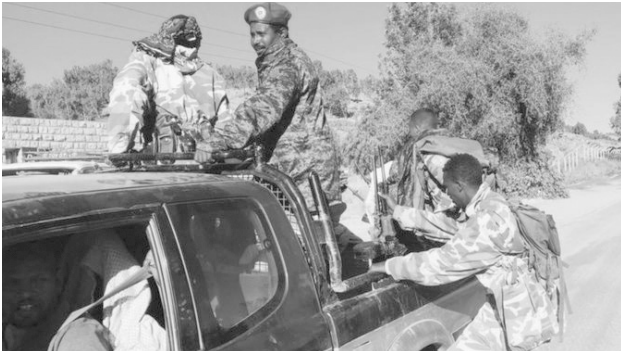
These Tigray special forces were pictured outside the Northern Command Headquarters