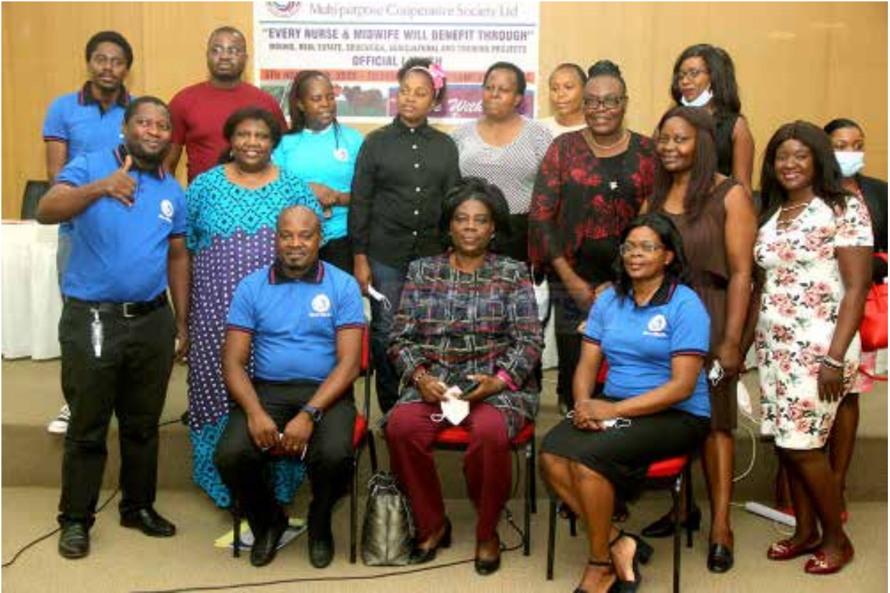
Lands Minister Jean Kapata poses for a photo with Zambia Nurses and Midwives Multi-purpose Cooperation Society Limited during the organisation's launch at Government Complex in Lusaka yesterday