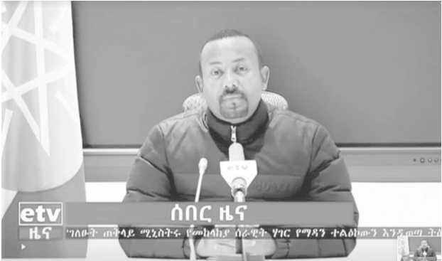
Ethiopian Prime Minister Abiy Ahmed addressed the nation on Wednesday evening