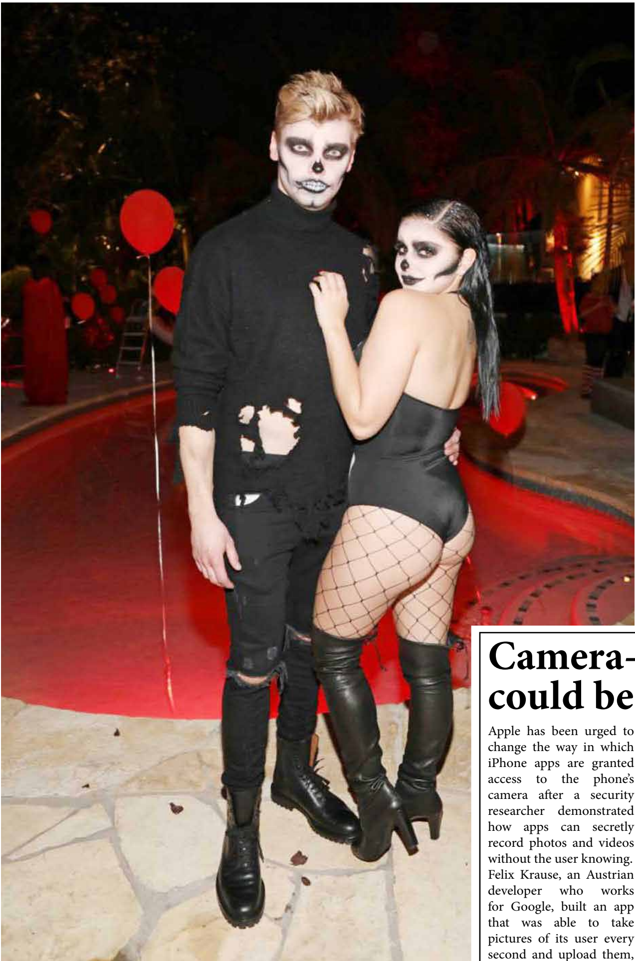
Levi Meaden and Ariel Winter at Just Jared’s Halloween party

doesn’t seem to impair sexual motivation or performance. If anything, it’s associated with increased coital frequency.” Although Eisenberg also noted that the study did not establish a causal connection between the drug and sexual frequency, he added that the result do hint at it. “The overall trend we saw applied to people of both sexes and all races, ages, education levels, income groups and religions, every health status, whether they were married or single and whether or not they had kids.” In addition, the results still held true even after taking into account the participants’ use of other drugs, such as cocaine or alcohol, which Eisenberg believes rules out the explanation that those who are less-inhibited and may be more inclined to use drugs may also be more likely to have sex. Sexual frequency also increased steadily as marijuana use also increased, suggested that it could play an active role in increasing sexual activity. Nevertheless, Eisenberg cautioned, “It doesn’t say if you smoke more marijuana, you’ll have more sex.” The findings can be found published online in the Journal of Sexual Medicine. Timeslive.co.za