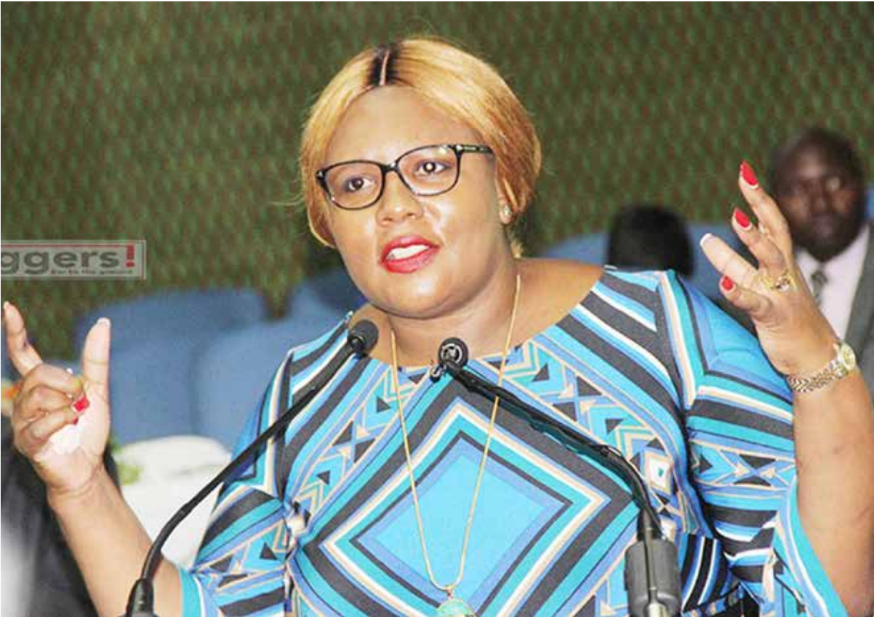
Agriculture minister Dora Siliya addresses farmers during the Zambia National Farmers Union (ZNFU) annual congress at Mulungushi International Conference Centre in Lusaka on October 26, 2017

farmers as supplementary funds. "Government will this year spend K1.7 billion paying it as cash to farmers. Each farmer will get about K1,700 on the card, they will contribute themselves K400. Now what this means is that government