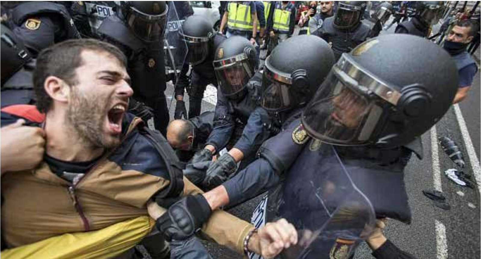
Spanish police cracking down on Catalan voters during the referendum vote which resulted in Catalonia’s declaration of independence

In March, militias ambushed and killed 40 police officers in Kasai, cutting off all of their heads. The same month two UN workers, a Swede and an American, were abducted and killed in the same region, having gone to investigate the abuses. BBC