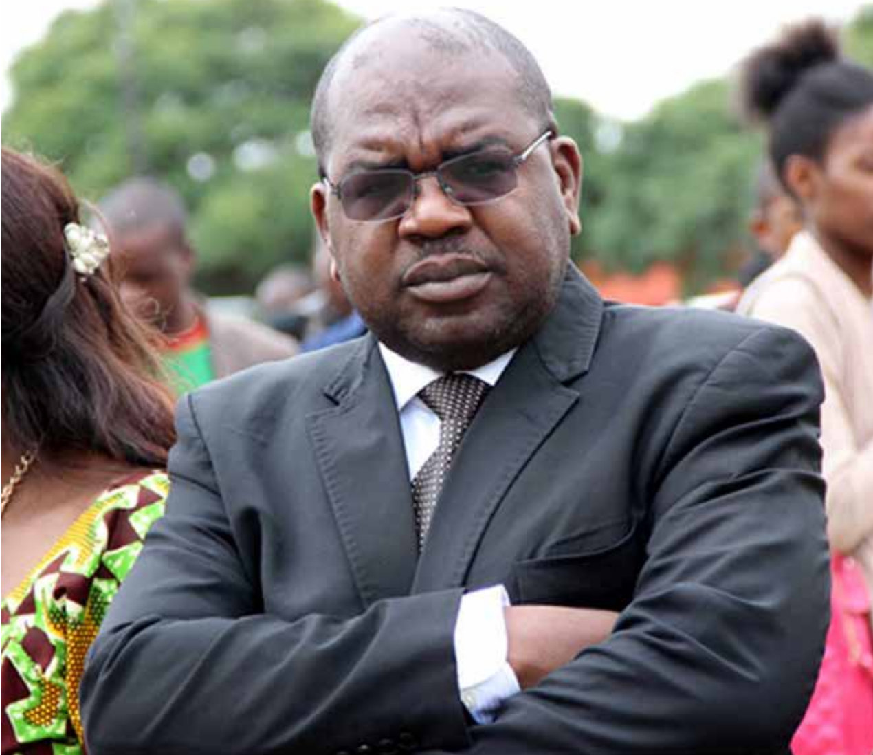
Health Minister Dr Chitalu Chilufya during Youth Day celebrations in Lusaka

“Chilufya is the most unpopular Minister of Health among the health workers here in Zambia. If the president wants to find out, let him appoint an inquiry. The people in the Ministry of Health today, their level of performance is very low because of Chilufya's conduct. And let me tell Chilufya, bu administrator or bu minister