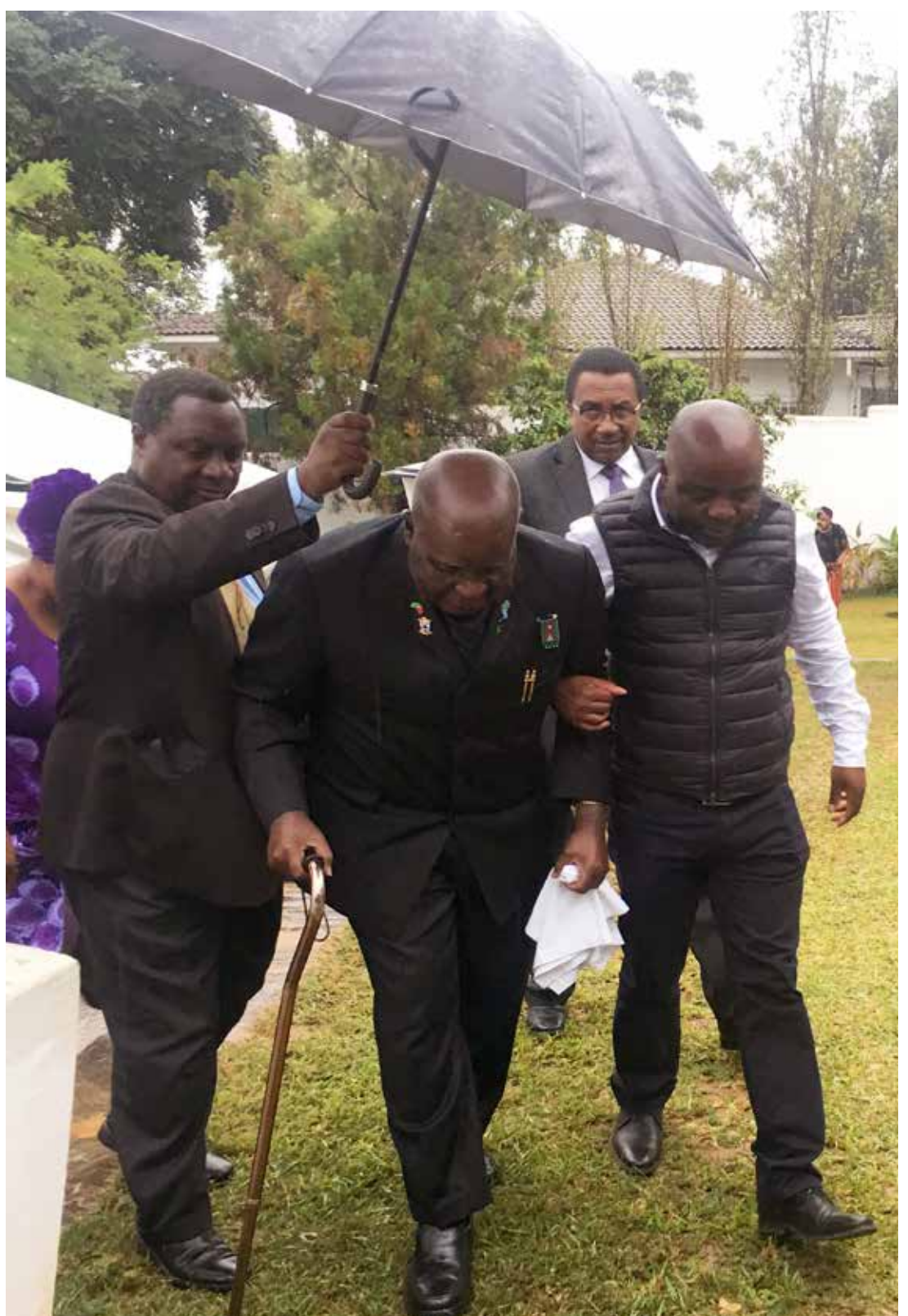
Dr Kenneth Kaunda leaves after attending a private luncheon at former first Lady Dr Christine Kaseba's residence, escorted by Home Affairs Minister Stephen Kampyongo. During the luncheon, KK apologised for missing Sata's memorial church service which was earlier held at the Cathedral of the Child Jesus.