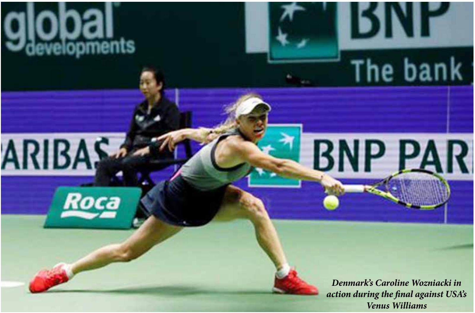
Denmark's Caroline Wozniacki in action during the final against USA's Venus Williams