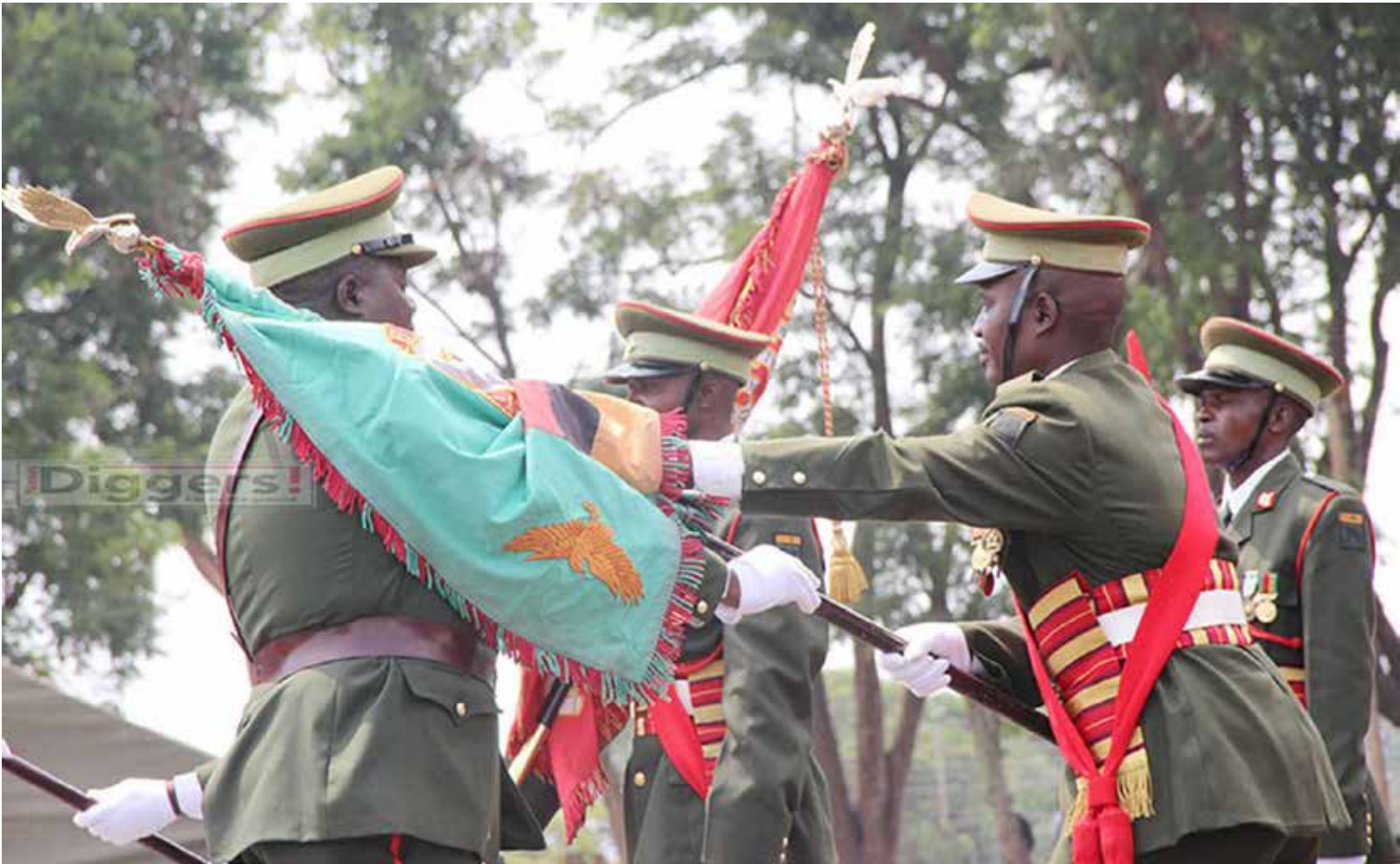
Zambia Army officers during the Trooping and Consencration of Colours parade at Lusaka’s Arakan Barracks on October 27, 2017

“I think there is a number of very difficult things that are going to happen to the economy given the current state of the Kwacha. One of the things that are going to happen is that the economy is going to face a lot of difficulties, there will be less importation of goods and high exports which is going to benefit the foreign market highly and this will affect the local market and in the process trickle down to the consumers who will suffer the worst by purchasing goods at extremely high prices being the end users,” said Mukumba.