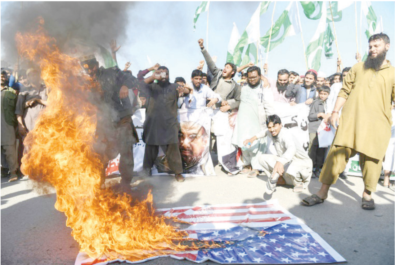
The US announced a freeze on aid to Islamabad at the beginning of the year, sparking protests in Pakistan

action by Islamabad against militant groups still persist. The announcement came weeks after Pakistan's new Prime Minister Imran Khan