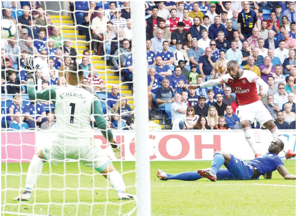
Cardiff 2-3 Arsenal: Alexandre Lacazette hits late winner for Gunners and seals points for Arsenal in thriller