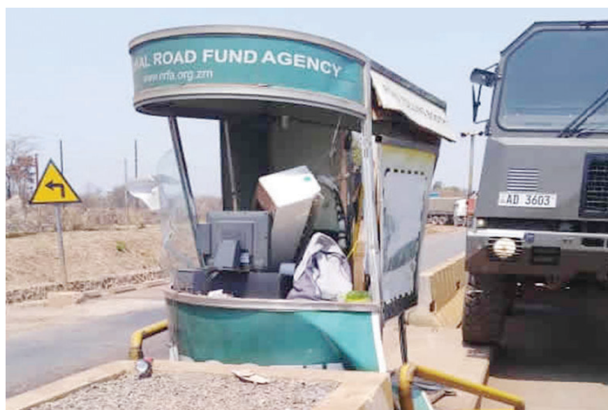
A Zambia Army armoured truck moving at a high speed and in the opposite direction of oncoming traffic crashed into one of the booths at Kafulafuta Toll Gate yesterday. NREA could not state why the truck was driving in opposite direction at high speed, but only stated that security vehicles are exempted from paying toll fees and referred queries to police