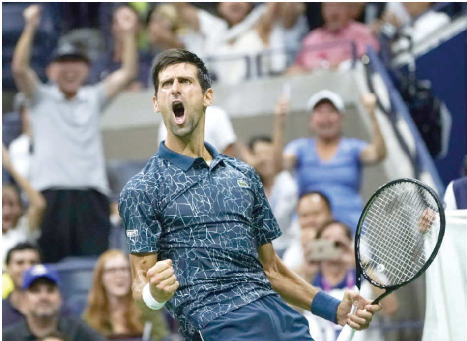
Night moves: Novak Djokovic celebrates a point in his US Open third-round victory over Richard Gasquet on Saturday.