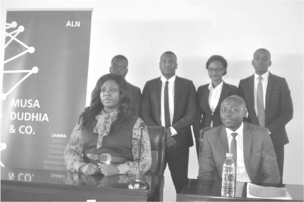
Participants of the Musa Dudhia inter university moot court competition at UNZA on Friday