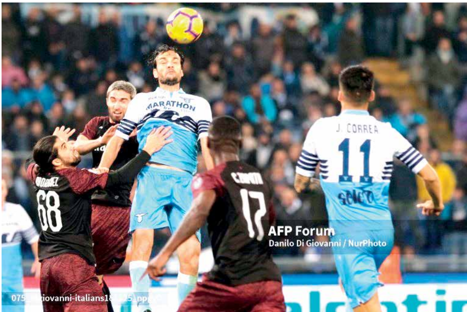
Marco Parolo of SS Lazio during the Italian Serie A 2018/2019 match between SS Lazio and AC Milan at Stadio Olimpico on November 25, 2018 in Rome, Italy.

...Chipolopolo didn't rise to the occasion