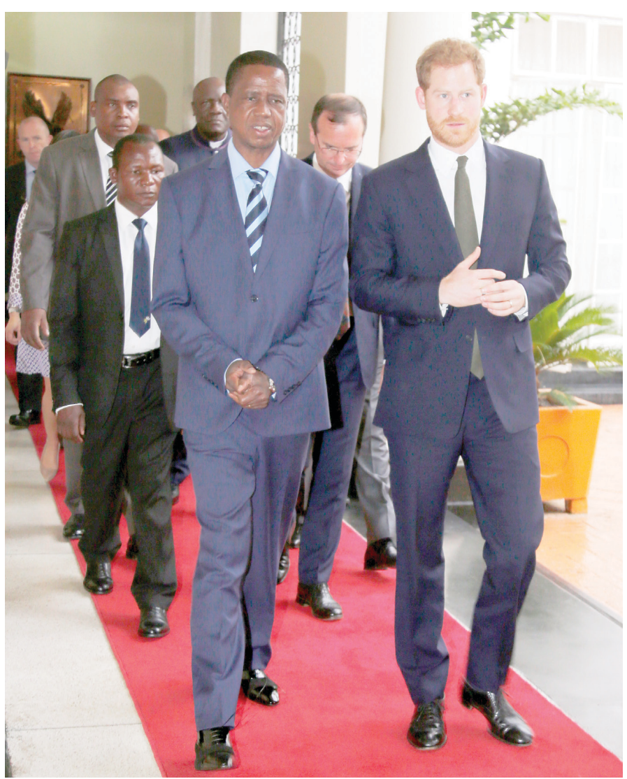
President Edgar Lungu welcomes Prince Harry at State House yesterday

Prince to buy elephants for Zambia Story page 2