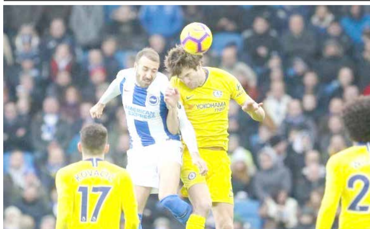
Brighton and Hove Albion striker Glenn Murray (17) battles for a header with Chelsea Defender Marcos Alonso during the English championship Premier League football match between Brighton and Hove Albion and Chelsea on December 16, 2018 at the American Express Community Stadium in Brighton and Hove, England