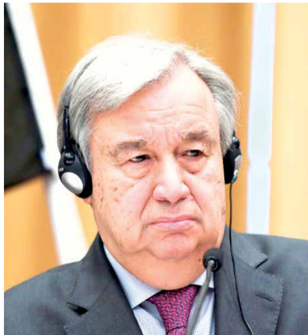
United Nations Secretary General Antonio Guterres at a news conference in Sweden

"Meanwhile, after the situation was brought under control, some forces were heard saying: 'He escaped before we could kill him,'" he added. BBC