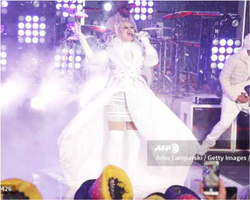
Kane Brown performs onstage during Dick Clark's New Year's Rockin' Eve With Ryan Seacrest 2019 on December 31, 2018 in Los Angeles, California