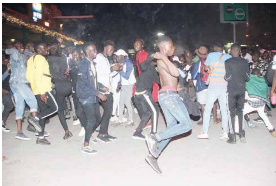
Lusaka youths pour to the streets around East Park Mall to celebrate the New Year on the eve of 2019