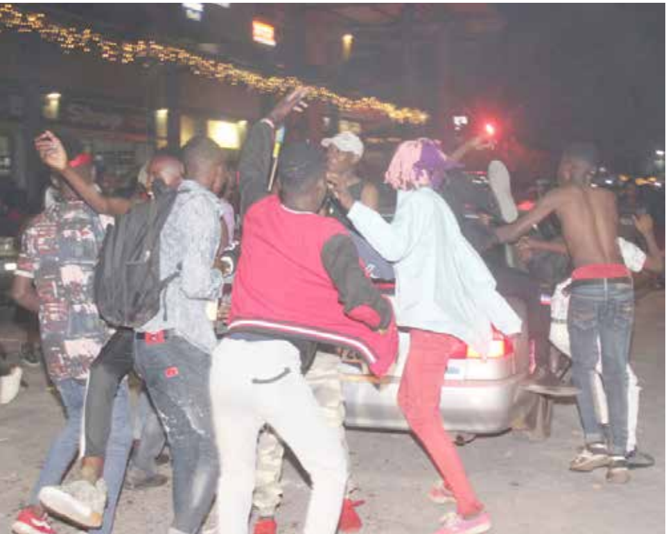
Lusaka youths during the New year count-down at East Park Mall