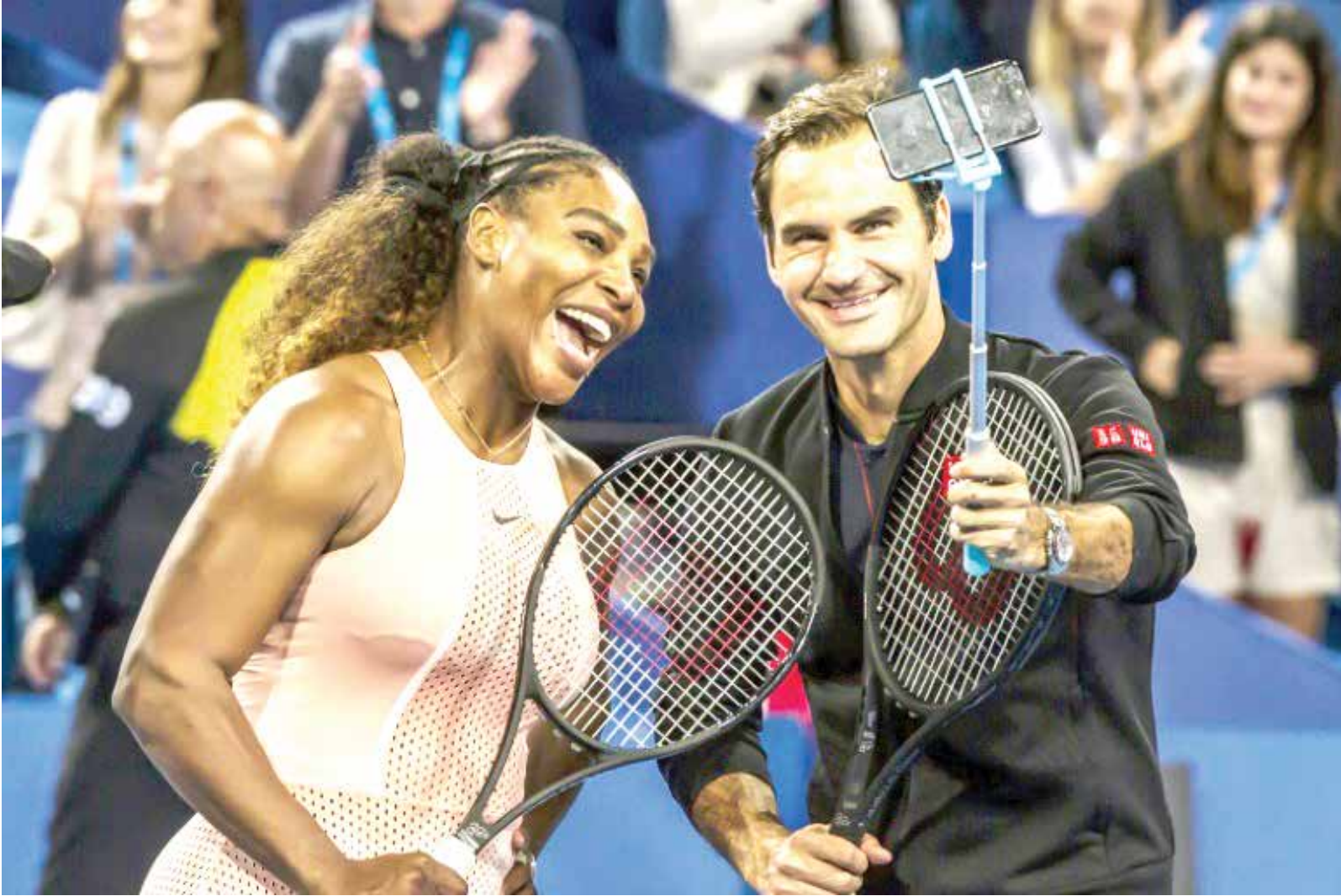
Serena Williams and Roger Federer pose for a photo after their match