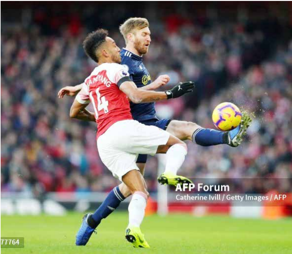
Tim Ream of Fulham battles for possession with Pierre-Emerick Aubameyang of Arsenal during the Premier League match between Arsenal FC and Fulham FC at Emirates Stadium yesterday