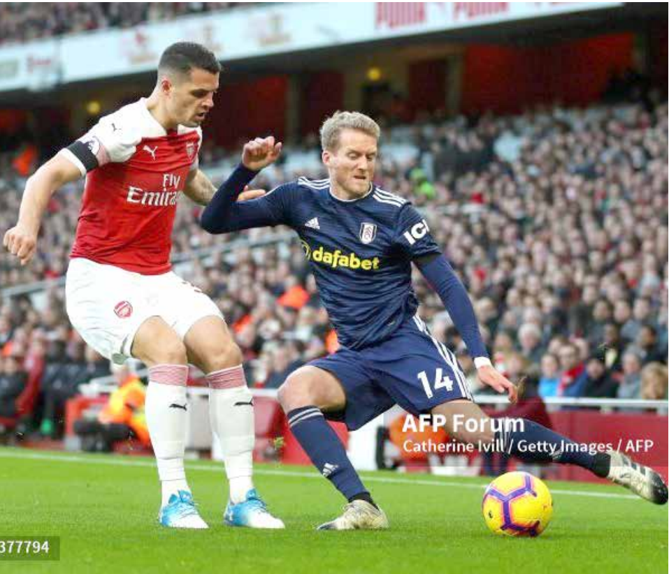
Andre Schurrle of Fulham battles for possession with Granit Xhaka of Arsenal during the Premier League match between Arsenal FC and Fulham FC at Emirates Stadium yesterday